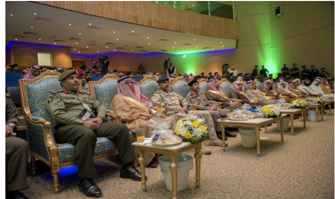
H.H. The Emir of Qassim region sponsors the closing ceremony of the training course in sign language trainers

Organized by the Deanship of Community Service at Qassim University in cooperation with the Directorate of Security Patrols in Qassim, Kingdom.