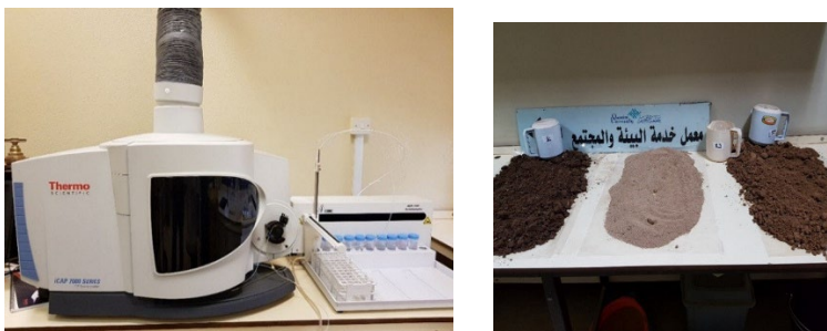
Figure 4: Part of the Environment and Community Service Lab

In addition, the laboratory records the results of the analyzes and keeps them as information of great importance to support the sustainable development of society. The following are tables of some of the years in which the preparation of the analyzes carried out by the Community Service Laboratory shows the environment, as well as some pictures of problems examined by the Botanical Clinic and developed appropriate solutions to them.