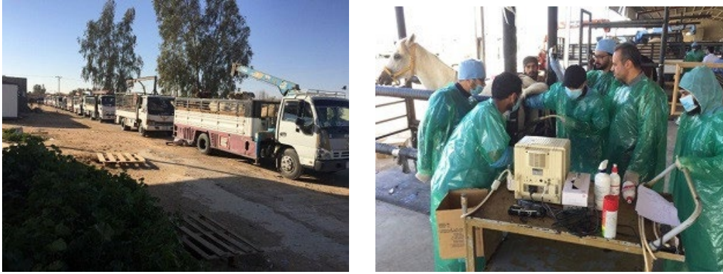
Figure 1: Some photos from the archives of the veterinary clinic