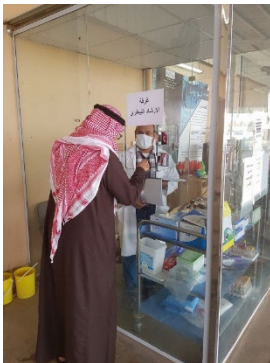
Figure 3: aspect of the veterinary guidance uni