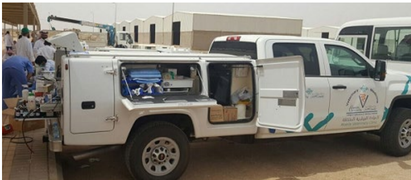
Figure 2: Side of the Mobile Veterinary Clinic